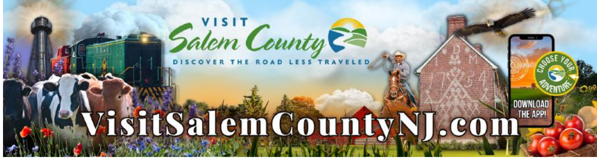
*PAID THROUGH A GRANT THROUGH NJSCA, THESE BILLBOARDS WILL BE PLACED IN THREE LOCATIONS.