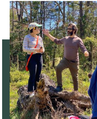
vineyard as a place for gathering and education---